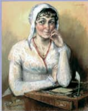
New portrait of Jane Austen

"Jane's history brought vividly to life."