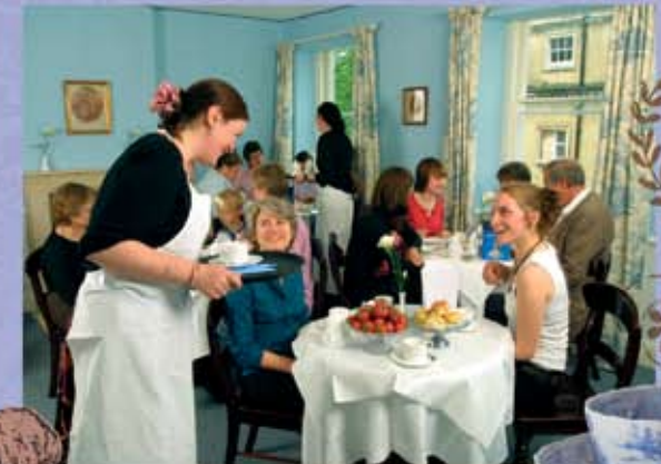
The Regency Tea Rooms

Taking tea and cakes in the Tea Rooms is very much part of your visit to the Jane Austen Centre. Our tea rooms have a lovely period atmosphere and very friendly staff. We look forward to your visit.