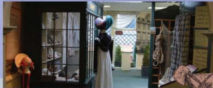
Inside the Exhibition

At the end of your visit you can relax and reflect for a moment whilst enjoying a pot of real leaf tea and a maybe some home made cake upstairs in our award winning Regency Tea Rooms.